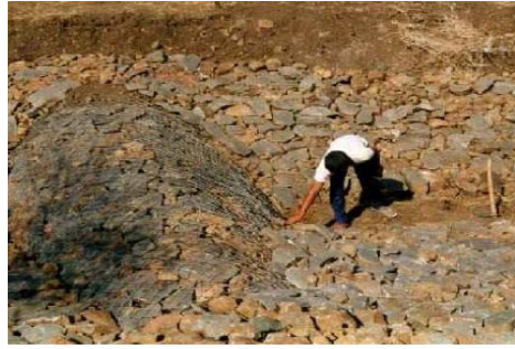
(b) Nala Bunds along drainage line